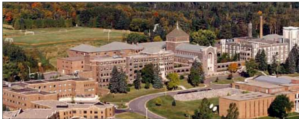
Aerial view of the Monastery, College and Benedictine Health Center and related buildings.