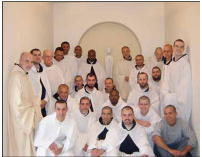
The monks of Our Lady of the New World Monastery

In 2010, our life was enriched by the arrival of nuns from Our Lady of Quilvo, Chile, to make a foundation at a site 40