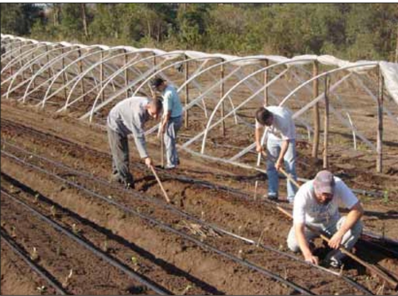
Monks working on an irrigation project

The Trappist Abbey of Our Lady of the New World (Nossa Senhora do Novo Mundo), located in Paraná, Brazil, was founded by the monks of Genesee, New York, in 1977. From a small community of four founders—one of whom is still vigorous at the age of 91—we have grown to a community of 27, with 17 solemn professed, 6 simple professed and 4 novices. We look forward to the entrance of three observers in the course of the next few months.