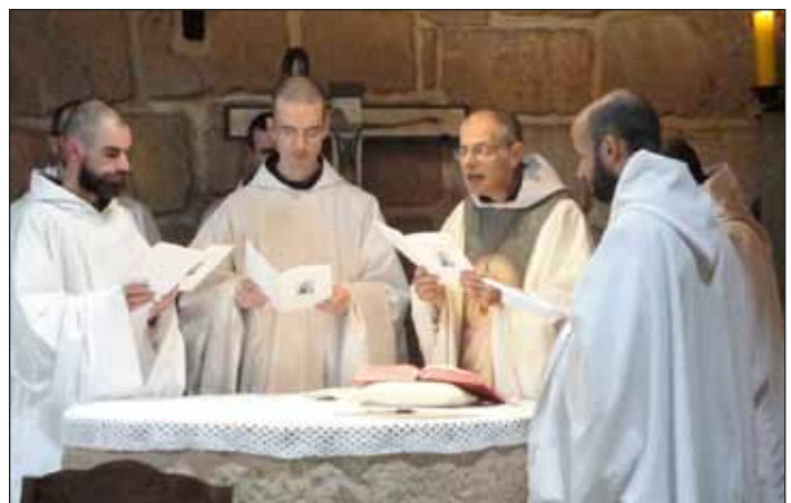
Schola Cantorum at Sunday Mass

A special grace for us has been the unfailing friendship and support of several religious communities of sisters, of our neighbors and of our diocese. In this friendship, we flourish.