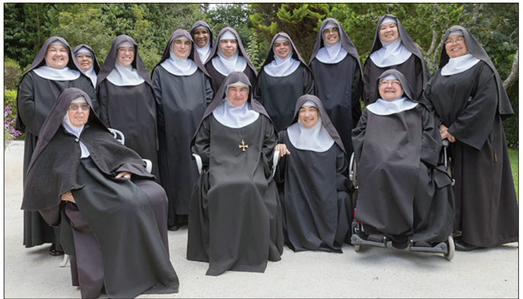
Mosteiro Sao Joao Brazil/St. John Monastery Brazil

The acquired knowledge was only possible thanks to the